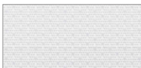
WARP TECH 9.88