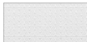
WARP TECH 8.88