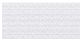
WARP TECH 7.88